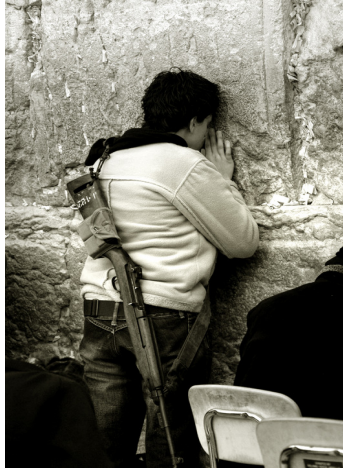
The Creation Of The Conflict

So how did the conflict begin? How did it continue? And where is it going? Let me give my brief and simple perspective in this limited space.